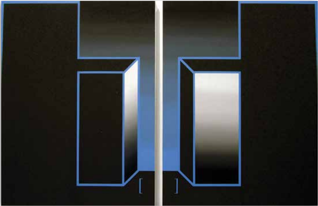
Dan Ramirez Epoche: L'échange VII (Dptych) 2014 oil, acrylic, iron oxide on panel 48 x 76 inches